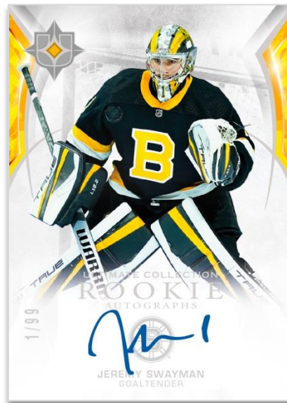
ULTIMATE ROOKIES AUTOS