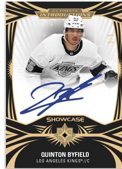
ULTIMATE INTRO'S SHOWCASE