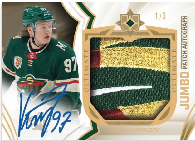
JUMBO PATCH AUTO VARIANT