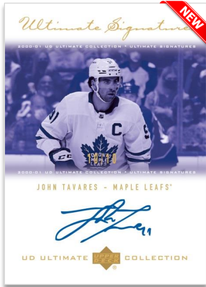
2000-01 ULTIMATE SIG. RETROS Gold Parallel