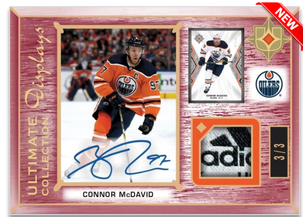
ULTIMATE DISPLAYS Auto Tag – Tier 2

New Additions! This latest edition of Ultimate Collection includes five new and incredible inserts: